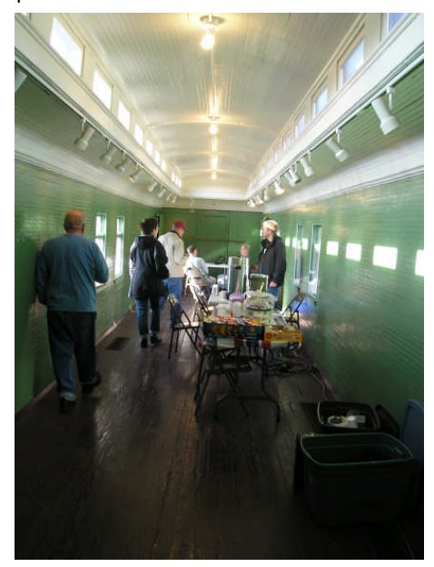
edge, just the right size for running in a coax.

a mast. Allan also brought endless amounts of rope and coax for the antenna work. An unused sliding door near our KØAGF Special Event station happened to have a hole in the bottom